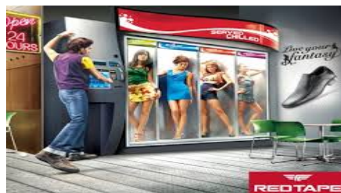
Figure 2. Red Tape Advertising Campaign, 2009

Arby's full-page ad has published in the 2009 Sports Illustrated Swimsuit Issue . The ad demonstrates that a pair of oversized roast-beef burgers, represented as female breasts, are held by a model's crossed arms. The tagline is "We're about to reveal something you'll really drool over." Arby's plans to capture attention of viewers by showing two burger buns as though they are taking off a bikini top and the brand actually tries to announce the new upcoming burger through creating awareness (Adams, 2016:73). Apparently, Arby's aim to create this so-called irritating content is to persuade the young male viewers of the magazine and the visual creates a fantasy as through implying that eating Arby's burgers will make you feel like eating a woman's sensitive body part. The brand creates a new social meaning by reproducing the idea that women breasts are like hamburgers. By objectifying woman as a food that can be desired and consumed, the brand has underrepresented woman like an object and offend them by taking a risk of losing them.