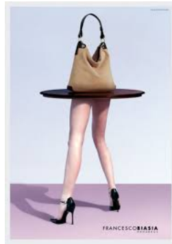
Figure 3. Francesco Biasia Advertising Campaign, 2002

of objectification- women as something to pick from and purchase at a leisure” (Sharp, 2009). The tagline of the campaign is “Live your Fantasy”. The question here is whether this ad is designed for promoting shoes or to state that women look like a fantasy product like a ‘drink’ and turn into a meta that can be bought and kept under control? Clearly, the ad has nothing to do with its purpose of creating awareness to Red Tape shoes in the content, rather it degrades the meaning of being a woman and proves the fact for demonstrating the male power over woman by underlying gender inequality as in most of the advertisements. The visual presents purposely women as incompetent and their existence can only be described by dressing up in shorts and tight clothes just to show off their beautiful bodies as an icon/object. Since, the main target of the brand consists of men consumers, it is expected from the sector to use objectified representation of women appeals to attract men and lead their desires.