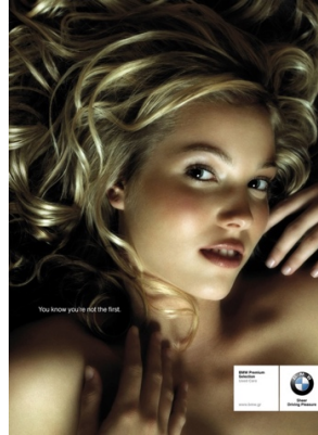
Figure 5. BMW's Advertising Campaign, 2008

there is an irritative simulation between woman and garbage. The image of 'perfection-supermodel' is framed as a 'useless/unnecessary product-garbage'. In both cases, the celebrity has used as her looks rather than her intelligence. At a social level, the profound effect of objectifying treatment is destructing women's self-esteem and positioning in life.