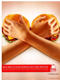
Figure 1. Arby's Advertising Campaign, 2009

As stated above, a known criticism is that advertising is a widespread cultural institution that often represents women in an irritating way like a decorative meta with their physical appearance and a watchable/desirable object. The problematic construction of interpreting the meanings of ads which women are objectified changes the social positioning(s) of women in the society. This qualitative study has analyzed advertisements from different sectors using convenient sampling method. Conveniently selected advertisements from different sectors without a time frame should be considered as the limitation of this research. The purpose here is to underline how the image of women is shown as incompetent, useless, sexual object, and likened to a meta regardless of pointing out to specific sectors.