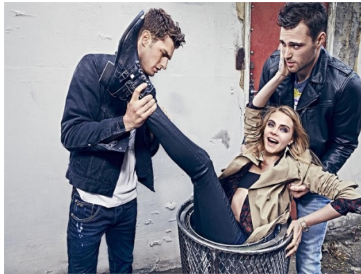
Figure 4. Pepe Jeans' Advertising Campaign, 2014

Francesco Biasia is an Italian brand for bags and accessories. The brand defines itself as the creator of high-impact look. The brand usually advertises its bags using sexually objectifying images of mostly women’s body parts. The chosen ad at the indicative level, presents a bag is sitting on a circular tabletop. The irritating part of the advertisement is that the legs of this table, are those of a woman, rather than any other material such as wood, steel or etc. Those legs aren’t any legs but are demonstrated as long and sexy legs of a woman perhaps in her mid 20s. In using these two particular images, the advertisers illustrate that there is further than a bag to think about in this advertisement. The point of view here is the further thinking represents objectifying woman by using the lower half of her body as a stand-in for a table. This other controversial and irritating ad emphasize that the image of women is as unnecessary as possible, except for the presence of only body parts.