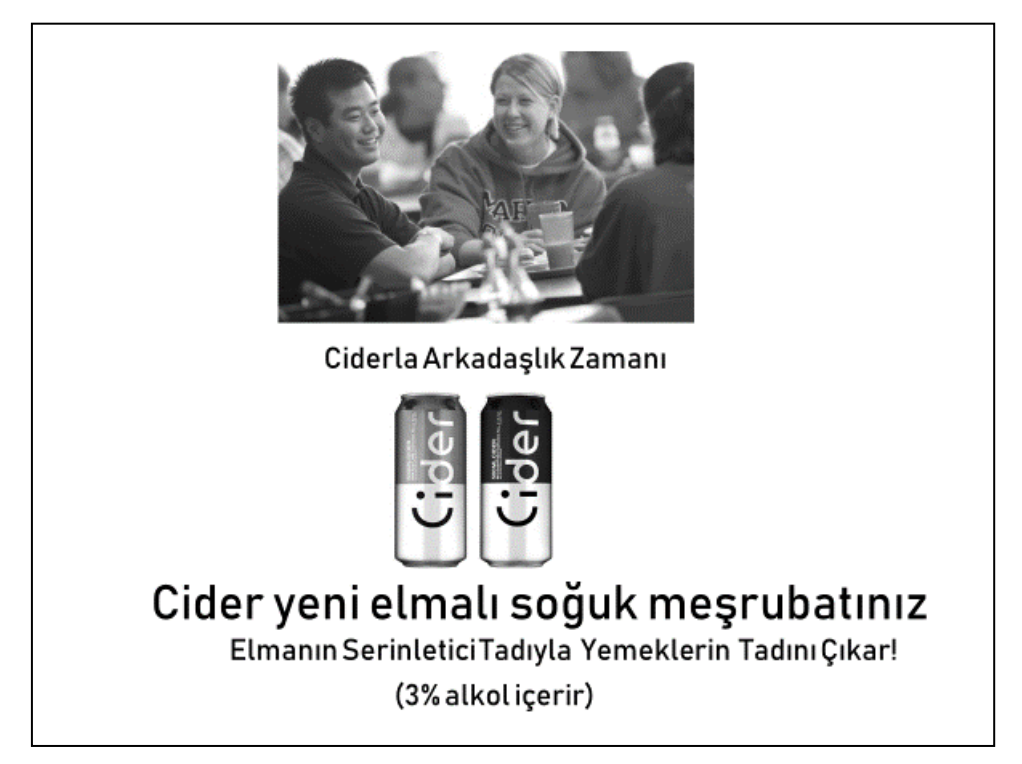
Figure 2. Ad Visual for Soft Drink Schema - Soft Drink Label Condition