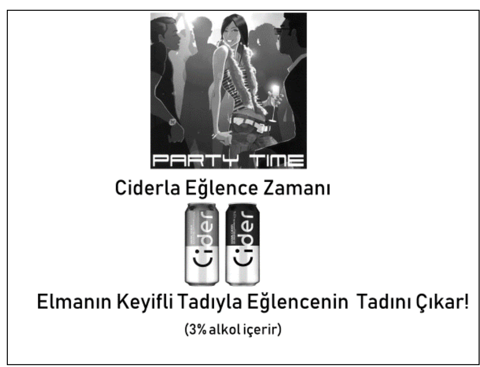
Figure 3. Ad Visual for Alcoholic Drink Schema - No Label Condition