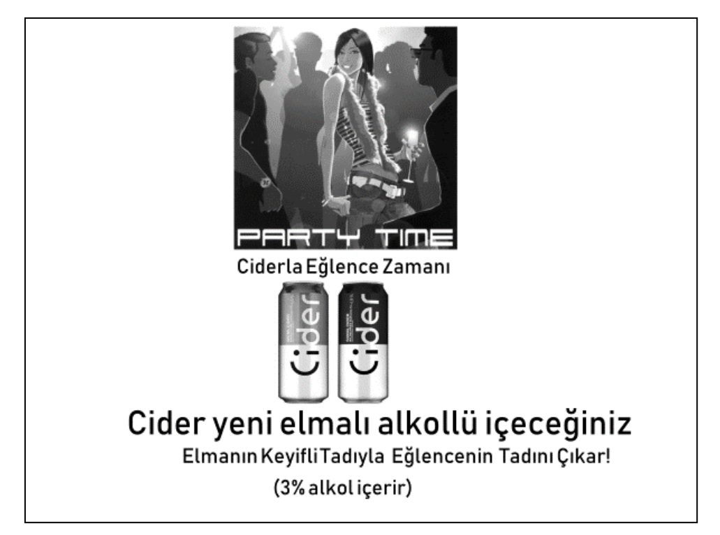
Figure 4. Ad Visual for Alcoholic Drink Schema - Alcoholic Drink Label Condition